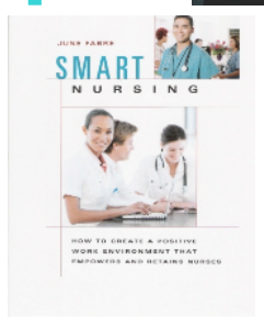
The cover of June Fabre's book